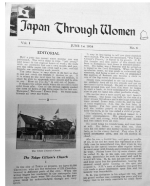
found in WCTU Library, Evanston, Illinois, summer 2014