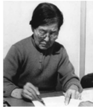
Yamaga city Board of Education 2009, p. 6

JTW was a product of its times. Its prewar mission was to give a voice to women to explain their viewpoint of the so-called Greater East Asia Co-prosperity Sphere. As Ogawa (2007, p. 170) wrote, “through the narratives of the Japanese